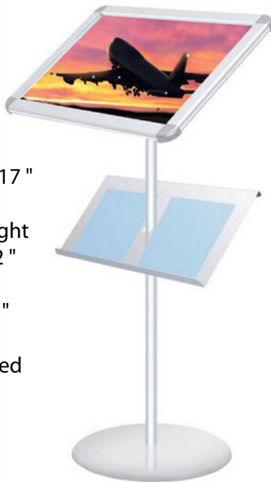
Shown with optional literature holder ADL-2

Size 11 x 17 " Pole Length 36 " Pole Shape Straight Diameter 1-1/2 " Holds Graphics Up to 1/16 " Base Diameter 16 " Base Curved Orientation Horizontal (-H) Vertical (-V) Color Options Black (-B) Silver (-S)